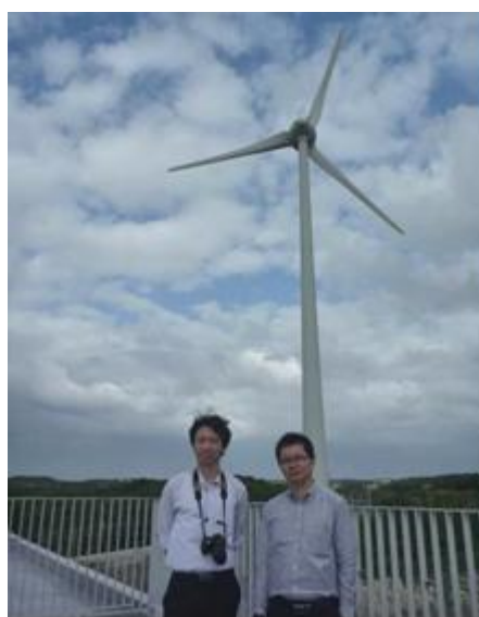
Miyako Island Mega-Solar Demonstration Research Facility