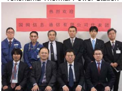
Mikuni Sales Office