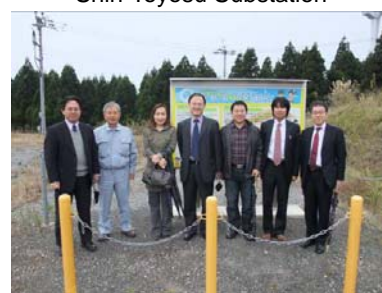
Nagashima Wind Farm