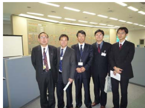
At Central Load Dispatching Center