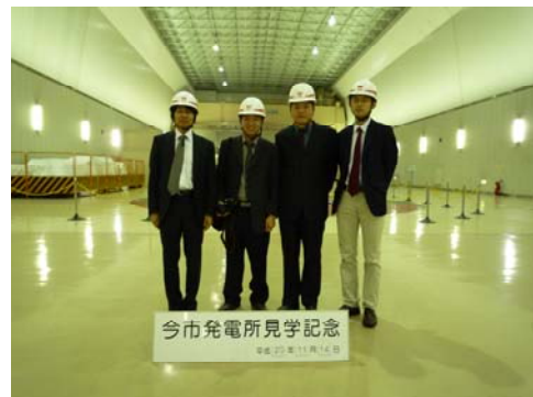
At Imaichi Pumped Storage Power