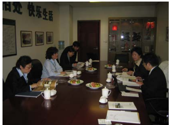
At Zhejiang Electric Power Corporation