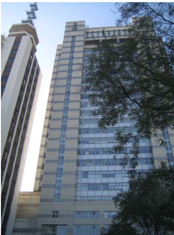
At CEPIC Building

(4) Technical Visit : Zhejiang Electric Power Corporation Fujian Electric Power Corporation Xie Yang Biomass Power Plant, Jiangsu